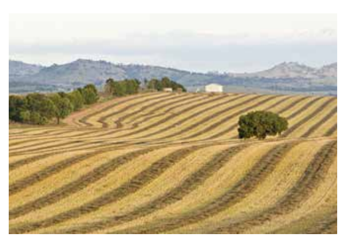
Image: Paddocks in Boorowa

Cover Image: View of Tamworth